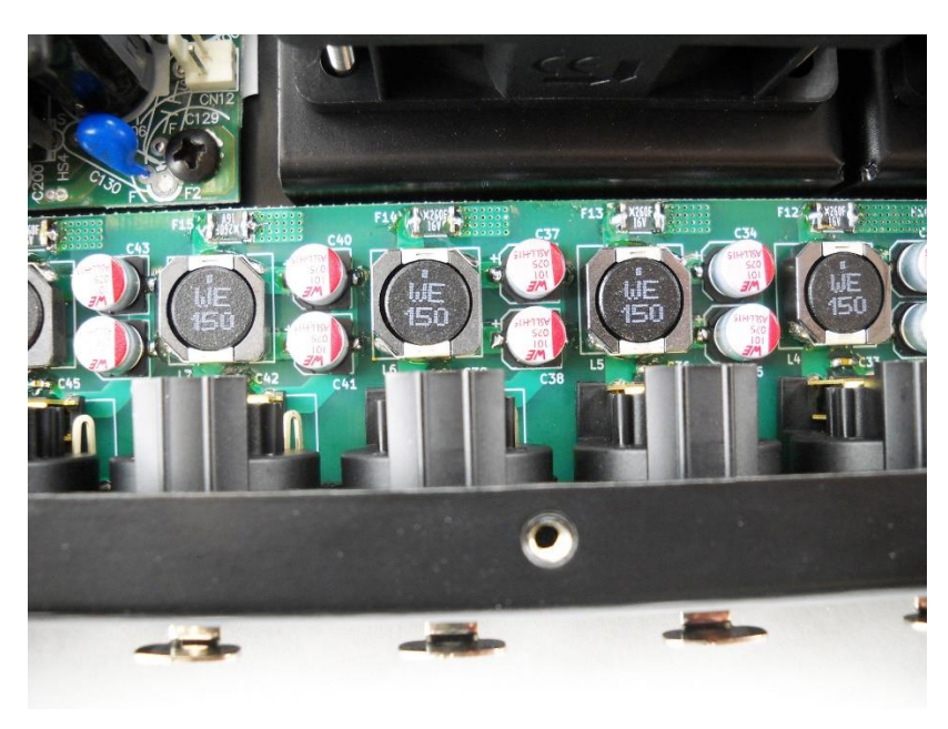
PSC Quiet Power tm Filters partially shown behind output XLRs.

POWER FILTERING: All PSC power products contain PSC Quiet Power Technology tm. This power filter technology allows the PSC Power Star Smart Traveler to deliver clean, quiet DC power for all of your sound equipment powering needs. These filters include both audio and RF frequency filters to ensure trouble free DC power distribution in the field. Nearly all of today's audio equipment contains DC to DC convertors within their power supplies. These convertors can and will cause inter-modulation noise when connected to common DC power sources such as a battery. Here at PSC we firmly believe that proper DC filtering can and will eliminate most noise issues in the field. Our competitors do not understand inter-modulation noise and thus do not take the additional steps to prevent it like we do at PSC. Though not every piece of equipment will suffer from inter-modulation noise issues. Here at PSC believe that the extra parts cost and design time are worth it if it solves even one issue in the field. Why do we go to the extra cost to include these parts? Because we think you deserve the best quality DC power available.