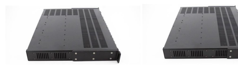
Rack Bracket Flush Mounted on Front

Your new Power Star Smart Traveler is designed to be rack mounted. It comes with a pair of heavy duty rack mount brackets. These brackets can be used from the front of the unit or the rear of the unit. Screws for installing these brackets are included. Please only use 6-32 x 0.375" screws with this Power Star LiFE. The use of longer screws may cause internal damage to the unit. These rack mount brackets can be adjusted to allow the unit to be flush mounted the edge of the rack or recessed mounted to the rack for connector clearance.