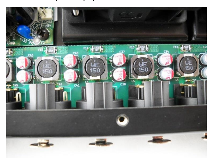
Each Output Connector has Dedicated PSC "Quiet Power" filtering

Each connector is individually Polyfuse protected and is fed power via its own PSC "Quiet Power Technology" power filter circuit. These PSC power filter circuits are exclusive to PSC power products and are one of the reasons we are the leading portable power supplier world-wide. These circuits help eliminate inter-equipment conducted RF and conducted DC power intermodulation noise. We go to greater lengths than our competitors to supply you with clean, reliable, noise free power for all of your equipment.