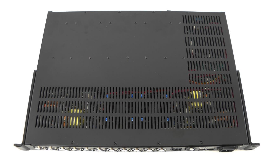
Top Cover Showing Cooling Slots. Do Not Block Air Flow to these Slots

COOLING: The PSC Power Star Start Traveler contains high powered charger circuits to provide quick and reliable charging of the four smart batteries. This charging function generates heat that must be removed from the unit in order that the unit stay within proper operating conditions. The Power Star Smart Traveler uses two, redundant AC power supplies and is equipped with very low noise fans that are operated at a slow speed to further reduce the noise level. You must leave open space above and to the sides of the PSC Power Star LiFE for proper cooling to take place. A minimum of 1 rack space (1.75") must be left open above the unit for cooling purposes. Likewise, this product should not be used in fully enclosed rack case or other enclosures that limit air flow (enclosed rack cases are fine, but do not install blank rack plates in the immediate opening above the Power Star Smart Traveler in both the front and back sides of the rack.) Failure to provide proper ventilation can and will damage the unit and will void your warranty.