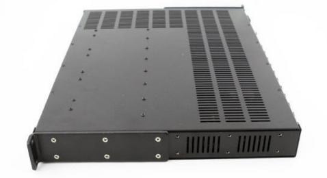
Rack Bracket Recessed Mounted on Rear