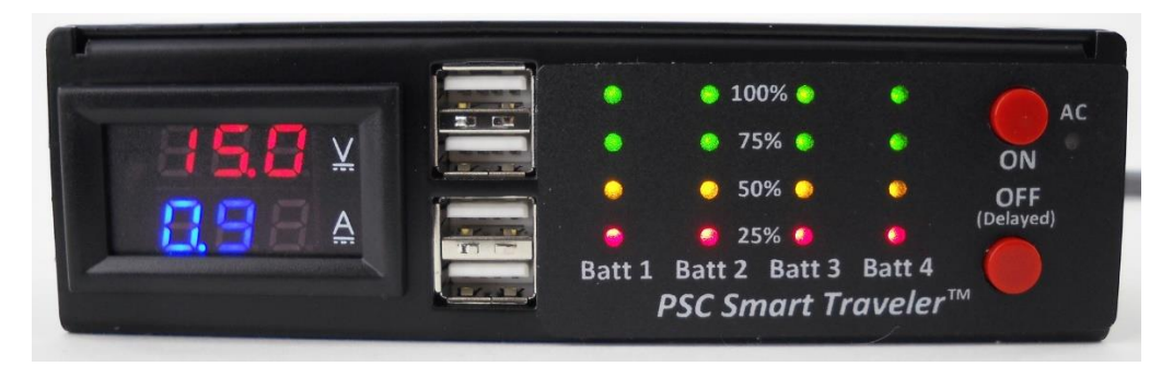
RED Power on and OFF switches

The PSC Power Star Smart Traveler can be operated (turned "ON" and "OFF") directly from the main unit or from the remote-control box. There are two round, RED momentary push button switches used to turn the unit on and off. These RED push button switches are clearly marked "ON" and "OFF". Please note that the "OFF" push button switch is equipped with a time delay circuit. You must press and hold this push button switch for 4-5 seconds before the unit will shut off. This time delay function serves to keep you from accidentally shutting down the PSC Power Star Smart Traveler unexpectedly while working.